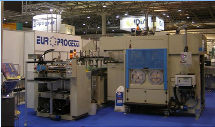
In 2008, the Europrogetti EP 240 was introduced on the "drupa" trade fair.

Carl Ingolf Lange GmbH • Philipp-Reis-Straße 6 • D-71642 Ludwigsburg • Germany Tel. +49 7144/8577 - 0 • Fax +49 7144/8577 - 29 • info(at)lange.de